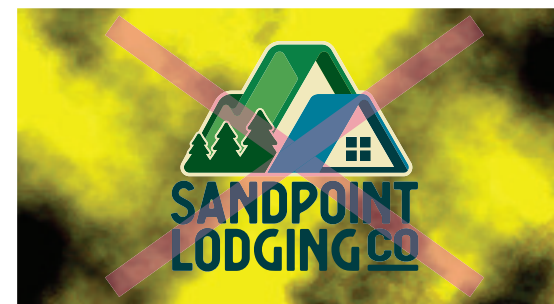
Do not place on a distracting background