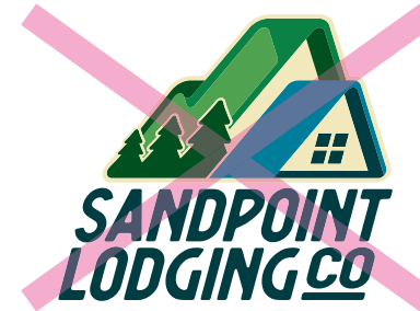
Do not warp the logo