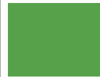
PANTONE+ 7738 C

C: 85 M: 10 Y: 90 K: 25 R: 0 G: 132 B: 69