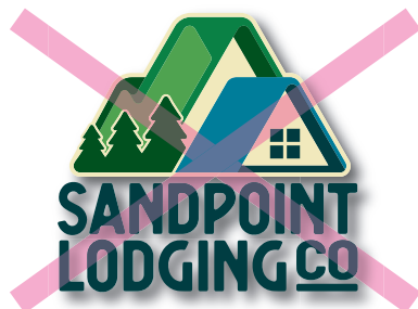
Do not add effects