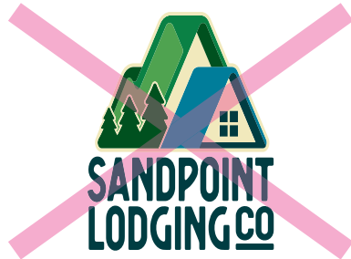
Do not warp the logo