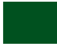
PANTONE+ 7484 C

C: 100 M: 0 Y: 100 K: 65 R: 0 G: 82 B: 33