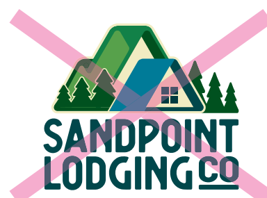
Do not add elements to the logo