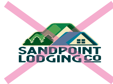
Do not warp the logo