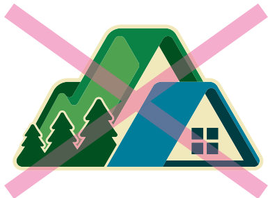
Do not remove elements of the logo