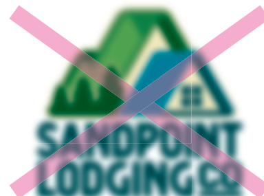
Do not blur or distort the logo